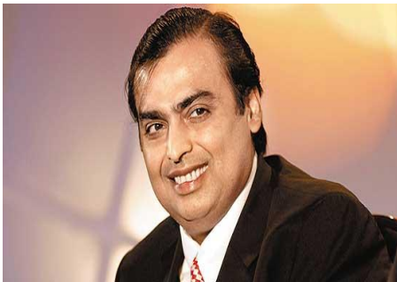
Mukesh Ambani Industries