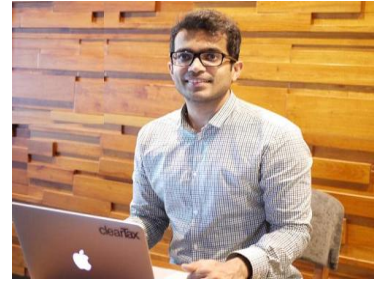
Archit Gupta Taxation System