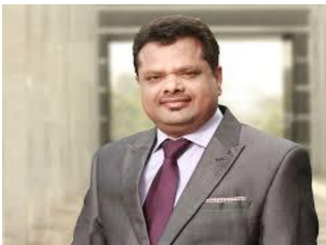
Rohtash Goyal Infrastructure