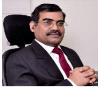
Abhaya Prasad Hota Banking System