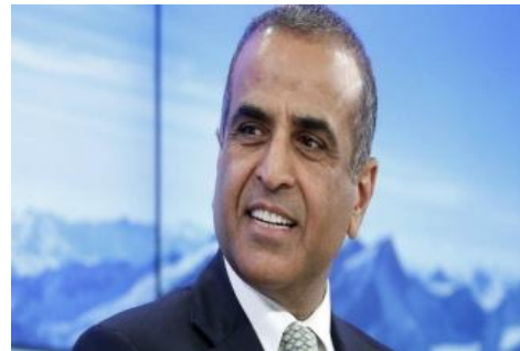
Sunil Bharti Mittal Services