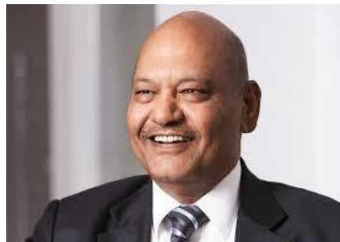
Anil Agarwal Natural Resources and Minerals

Note: All or any of the above names can be changed, if there is any better alternative in that field. This is a right of the public only to change.