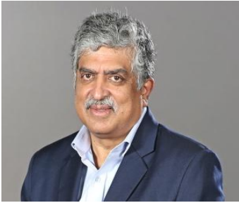
Nandan Nilekani Citizen/Business Information System

Note: All specializes in their respective field.